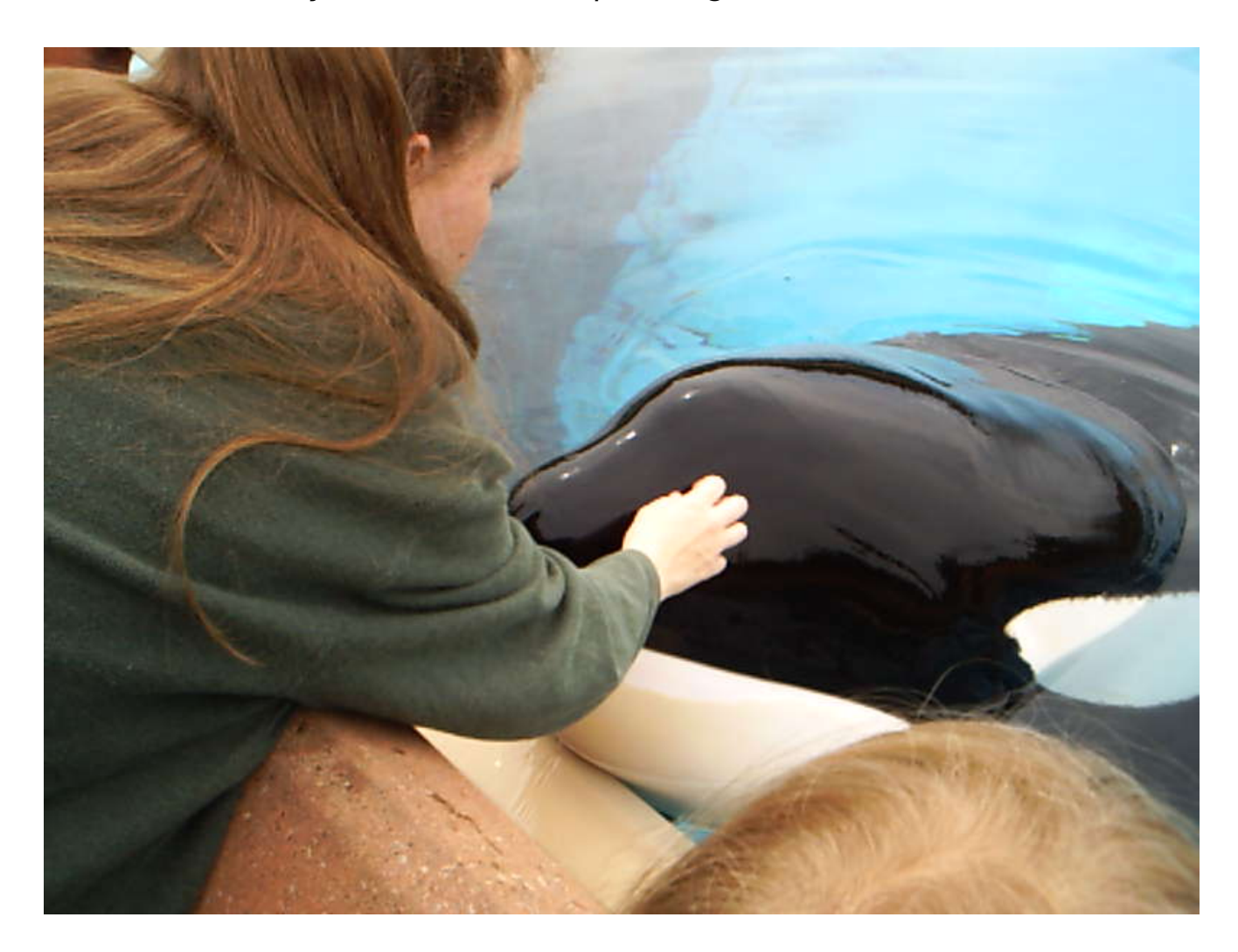
Washington, DC National Zoo

Bird Kingdom Niagara Falls Aviary, Niagara Falls, Ontario Marineland, Niagara Falls, Ontario — this place is very cool. You can hand-feed deer, Beluga Whales or even Orcas (Killer Whales). You can throw food down to bears who beg and do tricks. There are also a variety of amusement park rides for the whole family. Look at me petting the Orca!