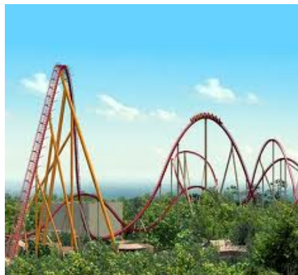
The Diamondback Roller Coaster