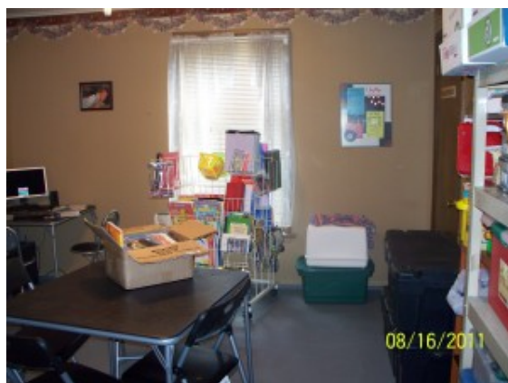
This summer we worked so

I know it's going to be a lot of work. I know I'm prolonging indefinitely the things I might want to do for myself once my kids are old enough to take care of themselves – any hobby, job or career path I might have wanted to pursue when the time came to put all of my kids on the bus for the day is moot. But I'm accepting that my career is Mom + Homeschool Mom, and right now, I can't think of any better use of my time than the investment I'm making in our family and the futures of my children.