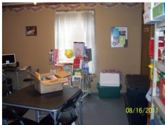
This summer we worked so hard on getting this homeschooling room ready!

I know it's going to be a lot of work. I know I'm prolonging indefinitely the things I might want to do for myself once my kids are old enough to take care of themselves – any hobby, job or career path I might have wanted to pursue when the time came to put all of my kids on the bus for the day is moot. But I'm accepting that my career is Mom + Homeschool Mom, and right now, I can't think of any better use of my time than the investment I'm making in our family and the futures of my children.