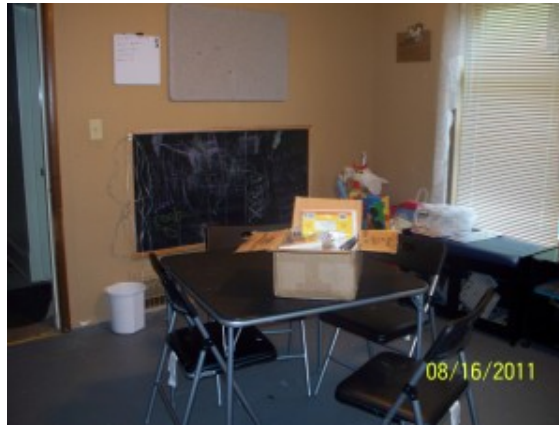
Taylor's books are on the table