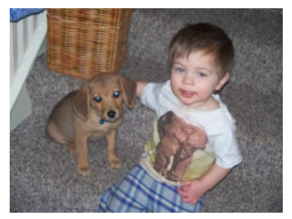
Gizmo will follow me up the stairs, but then he gets overwhelmed and can't go up or down! My 19-month-old son gave him a hug to comfort him; how cute is that?!?

After almost a week of having our new puppy, I finally got him to hold still long enough for some adorable pictures – enjoy!