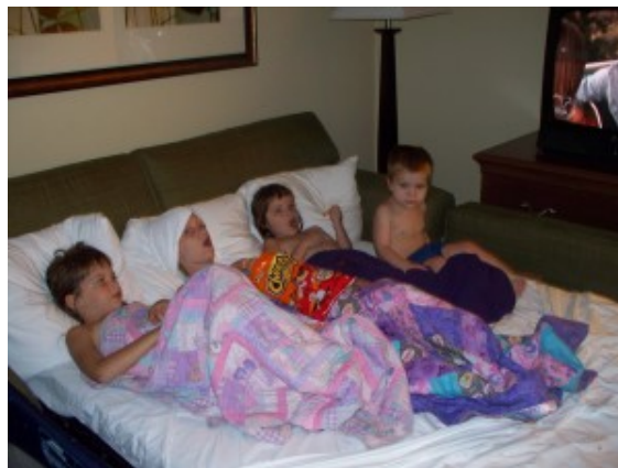
4 party animals in the hotel

learn that the mall's Dippin' Dots store (which is the only one anywhere nearby) DOES NOT carry my favorite flavor – Root Beer Float! But the Dippin' Dots were still delicious, and besides, that's just one more thing that makes Orlando that much more special – plenty of Root Beer Float Dippin' Dots in the store near Disney World, how I miss that place. We couldn't believe how crowded the Toledo mall was on a Wednesday afternoon, and because I hadn't been in one in years, there were all these new gadgets, gizmos, and what-nots that our family had to check out and play around with, probably making us look like total hicks. But that's ok, we had fun! And not only do I love living in a rural area because we have no crime, crowds, or traffic, but it makes things like visiting malls or big movie theaters rare treats and fun vacations!