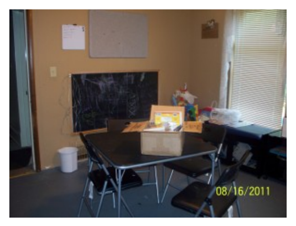
Taylor's books are on the table