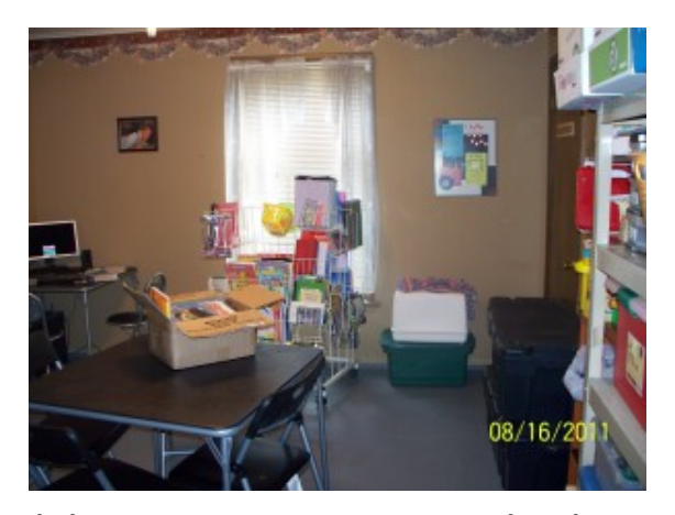
This summer we worked so hard on getting this homeschooling room ready!

I know it's going to be a lot of work. I know I'm prolonging indefinitely the things I might want to do for myself once my kids are old enough to take care of themselves — any hobby, job or career path I might have wanted to pursue when the time came to put all of my kids on the bus for the day is moot. But I'm accepting that my career is Mom + Homeschool Mom, and right now, I can't think of any better use of my time than the investment I'm making in our family and the futures of my children.